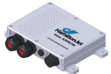
An Interface Module & all necessary cabling

The JETanchor system is integrated with the blue ARROW Control System