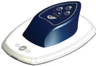
The new JETanchor Mouseboat

One JETanchor Mouseboat per control station